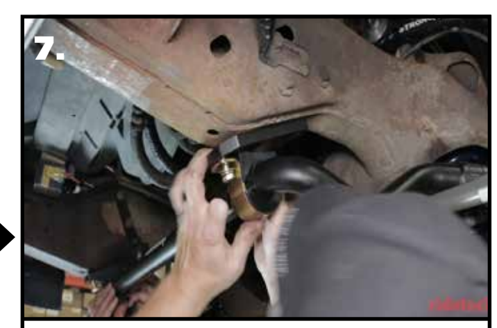
7. Slide the SwayBar into position on the S10 with the SwayBar arms above the tie rods. Install a 3/8" Lock Washer & 3/8" Flat Washer on the 3/8"x 3/4" Hex Bolts. Do NOT Complete tighten the Hardware, it will be left partially loose until the End Links are installed.