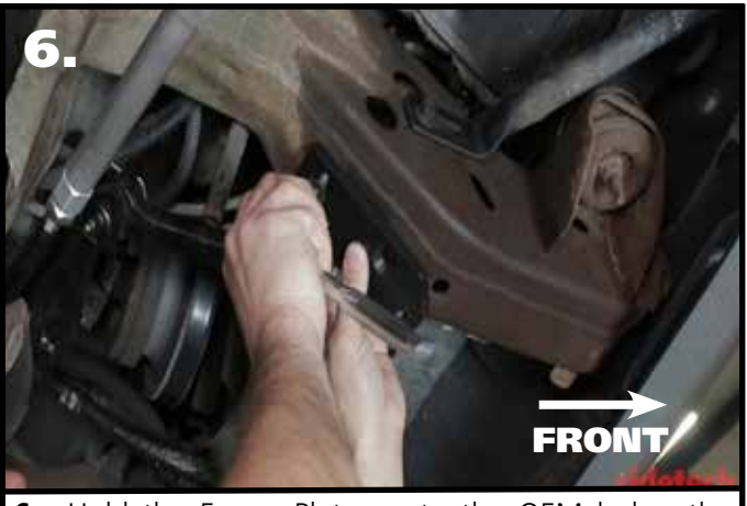
6. Hold the Frame Plate up to the OEM holes, the Counter Sunk holes will line up with the OEM threaded holes. The Plates are positioned with the threaded holes offset to the FRONT and INSIDE of the truck . Apply Red Loctite to the Flat Head Bolts. Torque Hardware.