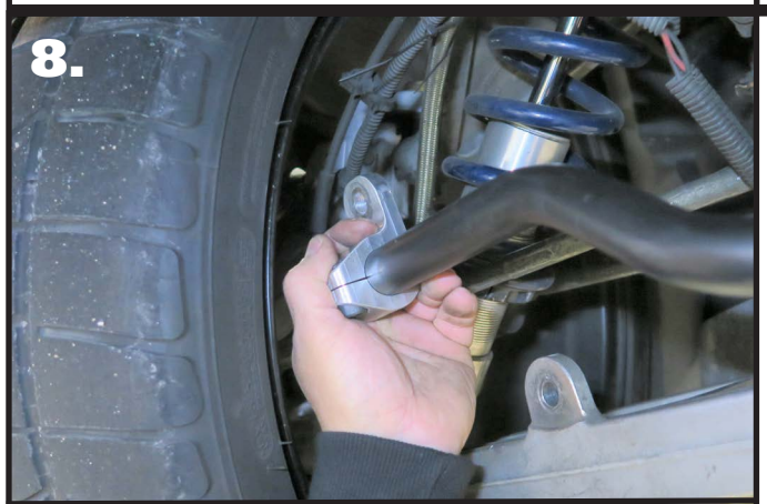
8. Apply Antisieze to the (4) 3/8"-16 x 7/8" Socket Head Cap Screws, thread them into the Clamp-On Ends. Install a clamp-on end on each end of the bar. The End Link mounting hole should be mounted to the outside of the bar and pointing up. Start with the mount flush with the end of the bar. Do not tighten the mount at this time.