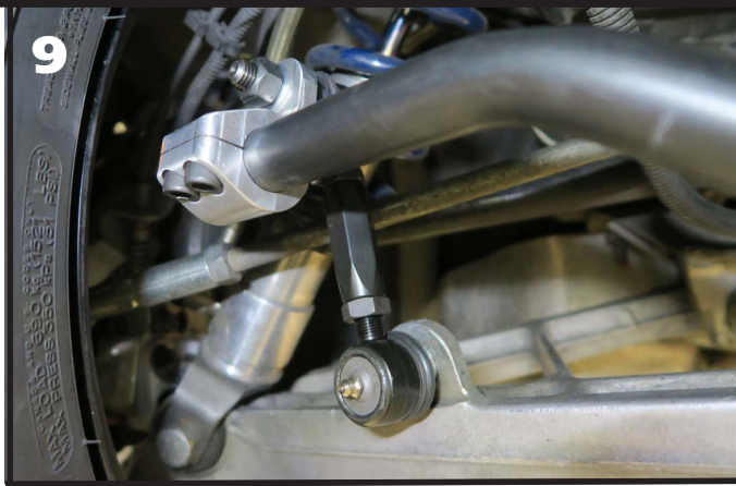
9. Thread the jam nuts all the way up the threads of the 90 degree ends. Evenly thread an end link into each end of the spacer until they bottom out. Adjust the endlinks out untill they are pointing in opposite directions of each other. Install the end links using Image 10 as a reference. Install both end links before tightening the end link hardware.