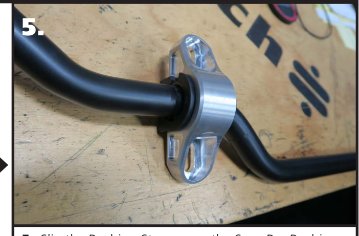
5. Slip the Bushing Straps over the SwayBar Bushings.