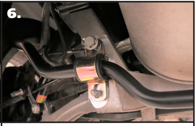
6. Insert the swaybar into position with the center bending down and the ends going forward. Use the OEM hardware to hold the swaybar in place. Center the bar side to side before tightening the hardware. Torque the lower nut to 70 ftlbs, torque the upper bolt to 49 ftlbs.