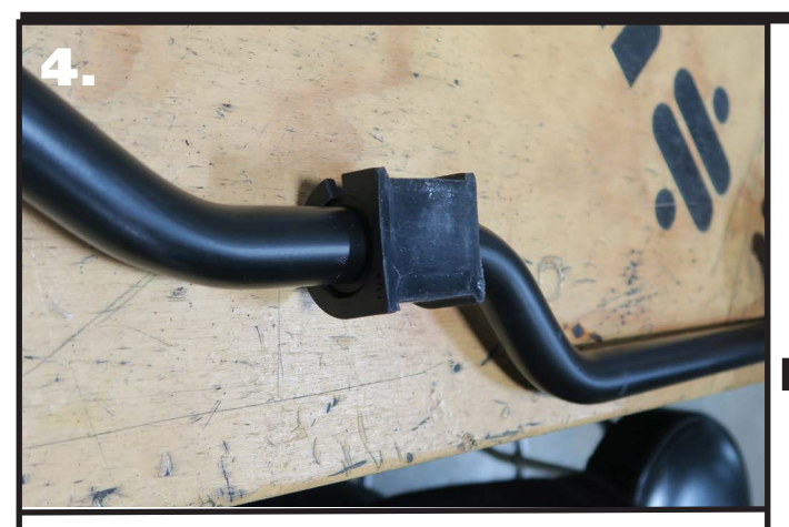
4. Open the Sway Bar Bushing at the split and slide it on the sway bar. Position it in the area that the bushing will ride based on the location of the stock swaybar. Do this on both ends of the swaybar.