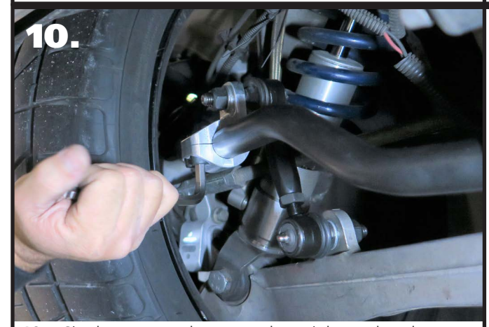
10. Sit the car on the ground to tighten the clamp on mounts. With the car on the ground, position the clamp ends so that the end link studs are parallel with each other. Torque the end link mounting nuts to 53 ftlbs. Torque the clamp ends evenly to 35 ftlbs. Tighten linkage jam nuts. Retorque the clamp ends anytime you do a rate adjustment.