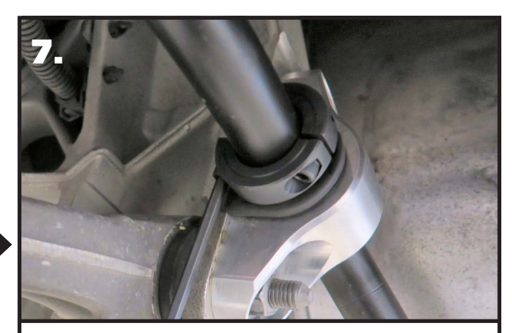
7. Install the locking rings on the outside of each bushing assembly. Use a hex key to take the locking ring apart. Reassemble it on the bar positioned next to the outside of the bushing assembly. Push the locking ring up against the bushing assembly and tighten.